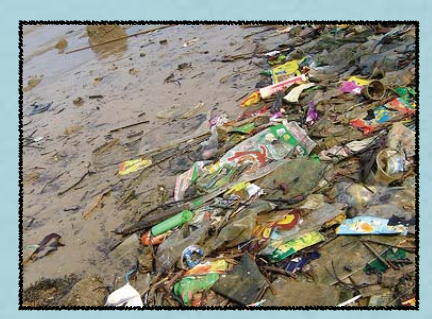
THE NUMBER ONE item found in MCS Beachwatch surverys were small plastic pieces. Plastics account for over 50% of all litter recorded. They stay in our environment and never fully disappear.