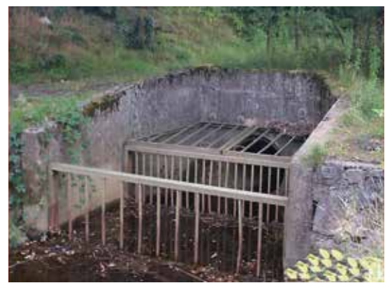
Maerdy Grids Regularly maintained by the Council