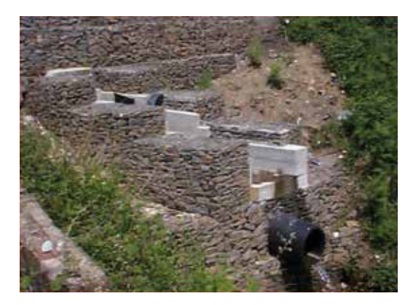
Prosser Terrace, Abercregan, Land Drainage/Highway Drainage Scheme Gabion works at surface water outfall

In an ideal world sewers would not be affected by heavy rain. The Borough is served in many areas by separate drainage systems for both foul water and surface water. A separate foul drainage system is not designed to be capable of taking surface water flows. They are only designed to cater for the relatively small amounts of 'dirty' water coming from toilets, baths, sinks and wash-hand basins of the properties connected to the sewer. If you divert water from your garden into the foul drain this could cause flooding to occur at some point downstream and possibly cause problems of incapacity at the treatment works which are not designed to cope with large rainwater flows.